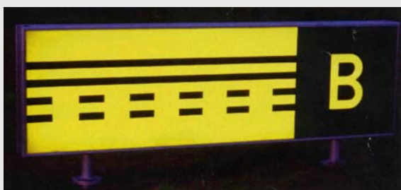
Figure 1. Examples of guidance signs.